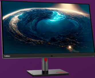
ThinkVision P32pz-30 Display