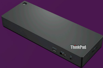
ThinkPad Workstation Thunderbolt™ 4 Dock