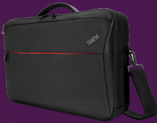
ThinkPad 14-inch Professional Slim Topload