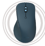
Lenovo Slim Mouse