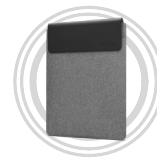
Lenovo Yoga 16-inch Sleeve