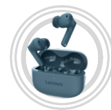
Lenovo TWS YOGA PC Edition