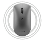
Lenovo Yoga Slim Mouse